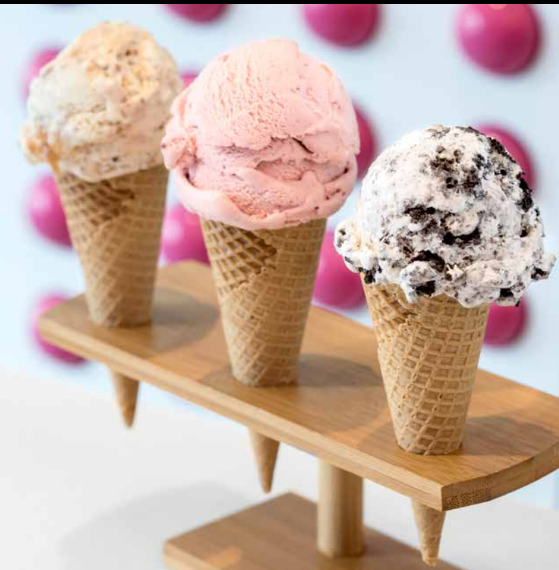
ICE CREAM CONES