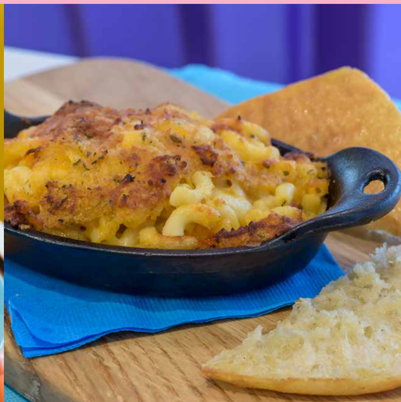
MAC & CHEESE