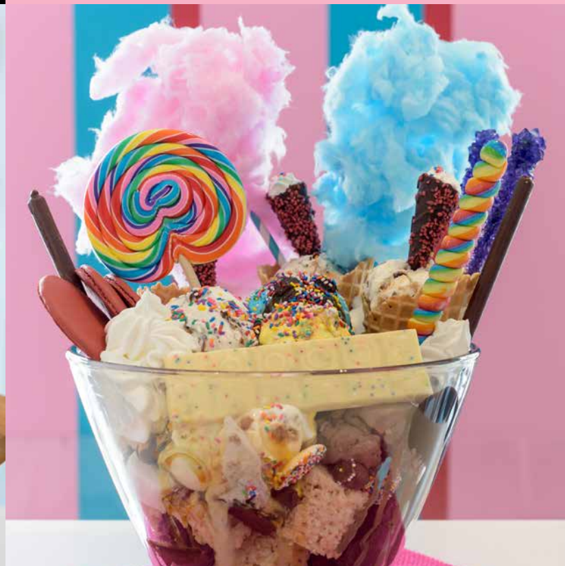
I BET YOU CAN'T SUNDAE