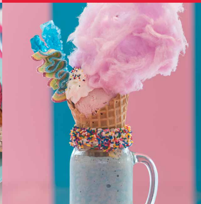
BEST OF BOTH WORLDS SHAKE CARNIVAL