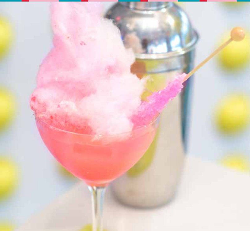
COTTON CANDY CLOUDS