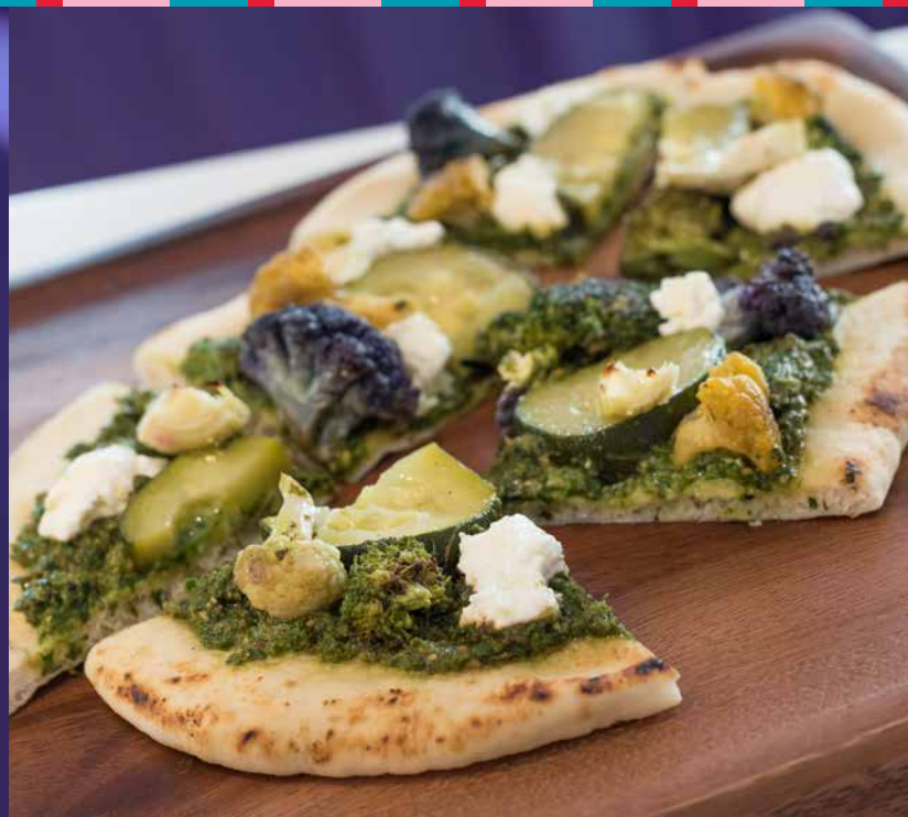
ROASTED VEGGIE FLATBREAD