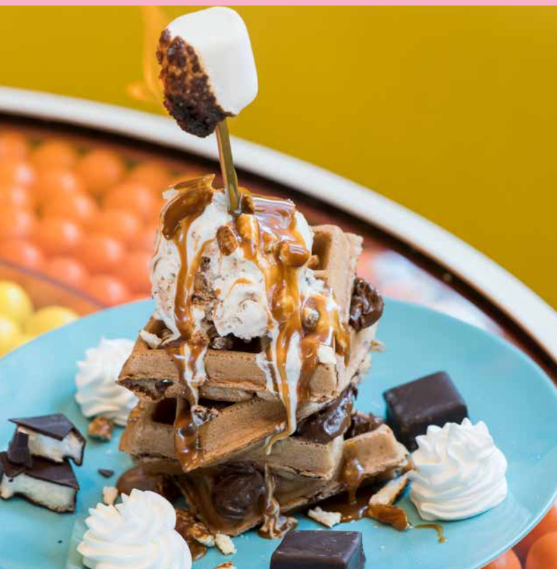
BREAKFAST OF CHAMPIONS