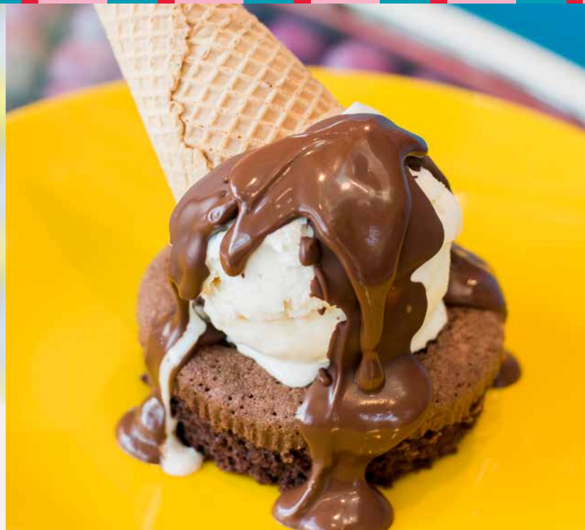
BREAK ME OFF A PIECE OF THAT