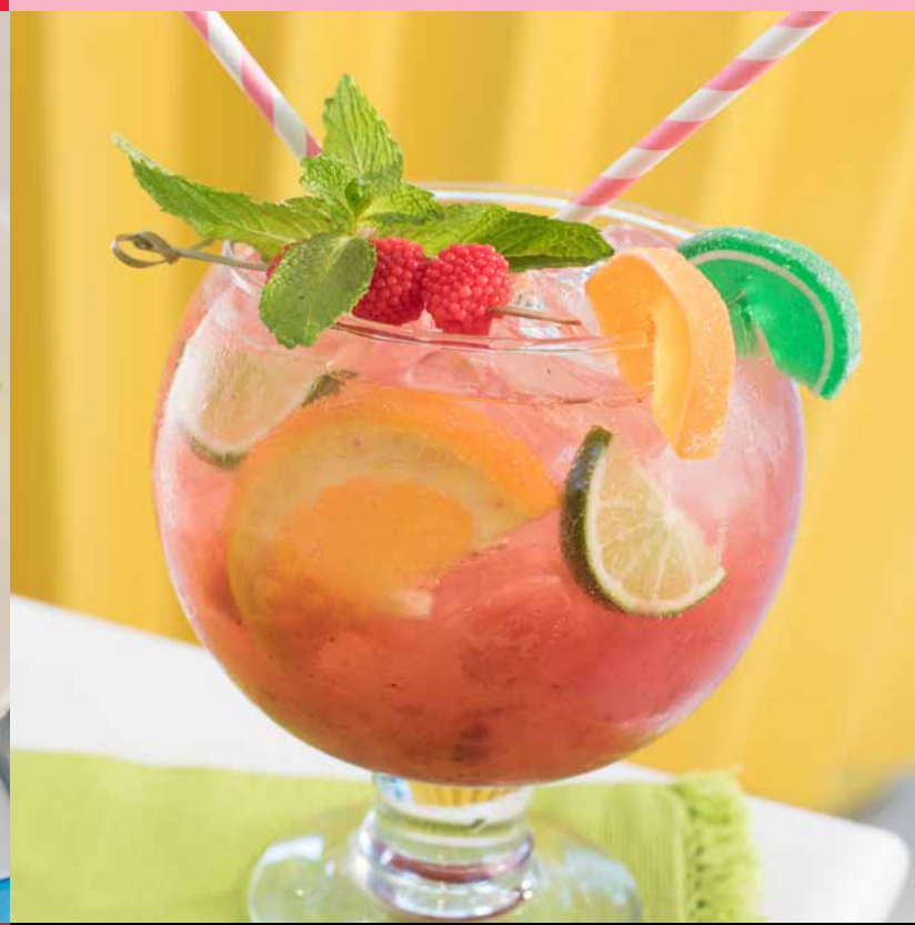
BERRY SPARKLER GOBLET